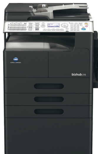
Optional configuration with DK-707 Copy Desk.