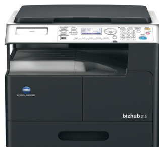
Base product without options.

The bizhub 215 expands your productivity with sleek design for desktop placement or for modular expandability that lets you add a mid-size cabinet, 100-sheet bypass tray and up to four optional 250-sheet drawers for floor-standing setups.