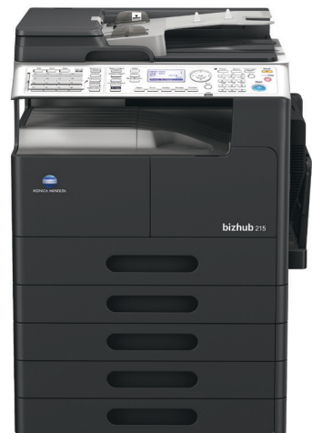
Optional configuration with four paper drawers.